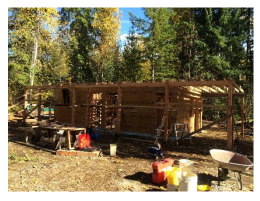
Ceiling Joists Under Construction